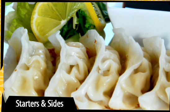
Starters & Sides