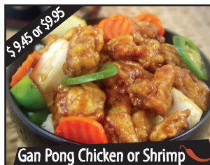
Gan Pong Chicken or Shrimp