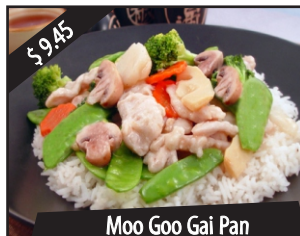
Moo Goo Gai Pan