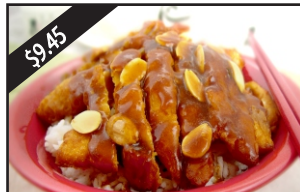
Almond Boneless Chicken

Served with Steamed White Rice Substitute Egg Fried Rice for .50 extra